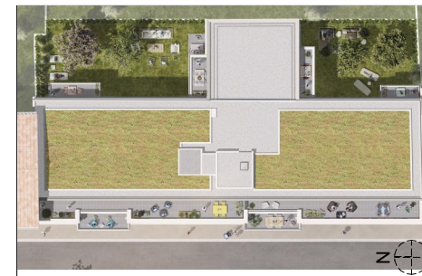
Plan du Sous-sol